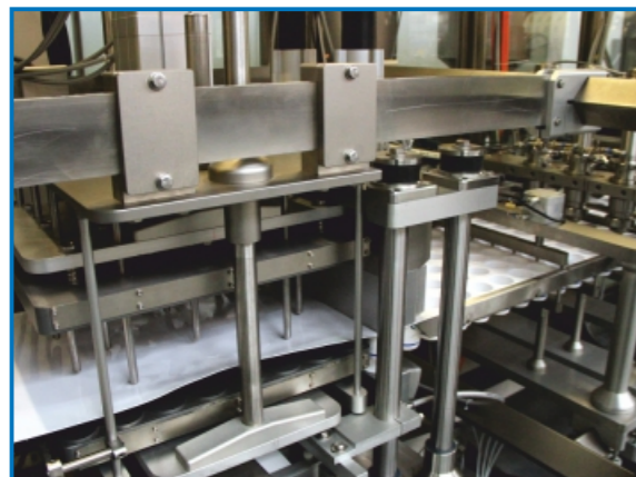
PRE-HEATING & FORMING STATION

The 9100 Series of machines are designed for integration with TREPKO's End of Line Solutions (700 Series).